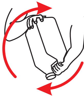
Flip Upside Down

Remove protective seal and use accordingly. Fill the jug with water and cap. Once again use the 'flip and rock' motion above to rinse the jug of any remaining product.